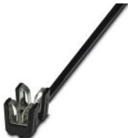
Shield connection clip, color: black

Please be informed that the data shown in this PDF Document is generated from our Online Catalog. Please find the complete data in the user's documentation. Our General Terms of Use for Downloads are valid ( http://phoenixcontact.com/download )